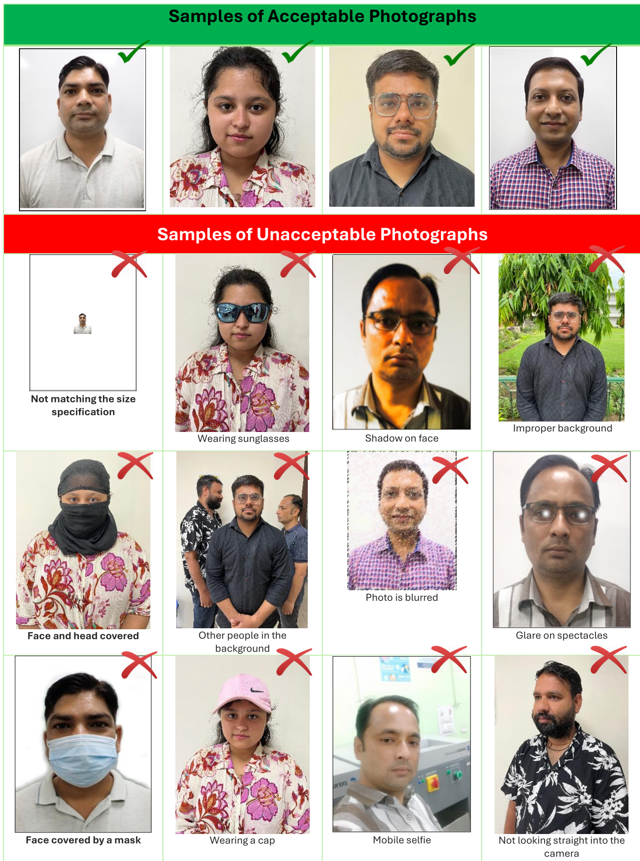
Table 9: Samples of acceptable and unacceptable photographs