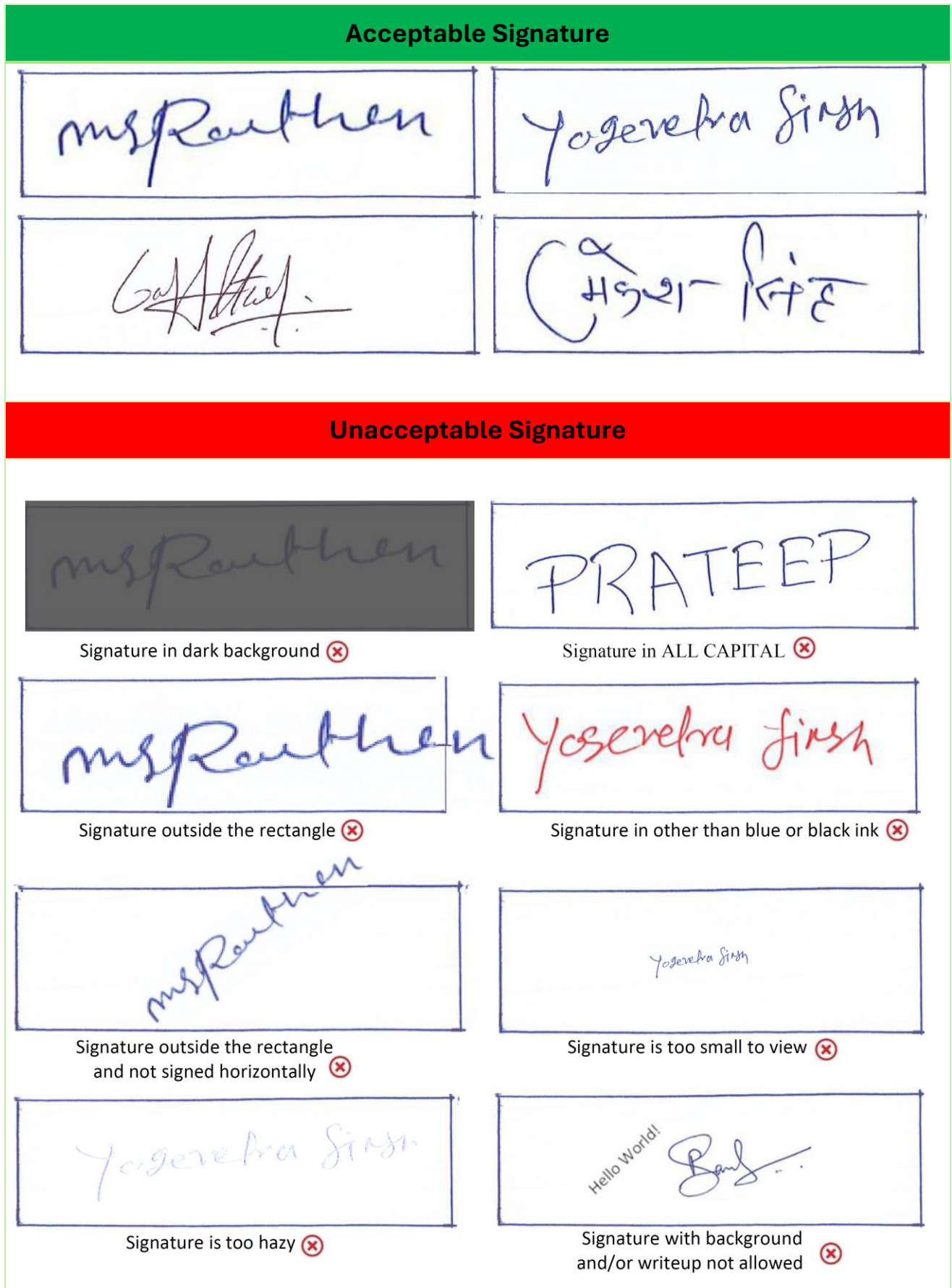
Table 10: Samples of acceptable and unacceptable signatures